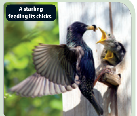
A starling feeding its chicks.

WOW! There are 621 species of bird in Britain. The wren is the most common; there are 11 million pairs across the UK.