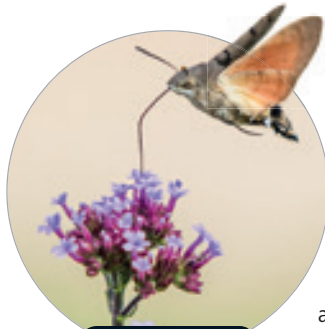
A moth uses its proboscis to feed.

Researchers from University College London (UCL) have found that during the night, moths visit