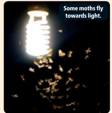
Some moths fly towards light.

You might have heard people using the saying, "like a moth to a flame". It is usually used to describe a person with a strong desire to do something, even though it is likely to be bad for them. The phrase comes from the fact that certain types of moths often fly towards light sources like candles or torches at night, even though they can be hot enough to kill bugs. There is no definite answer as to why they do this. One theory is that because moths may use moonlight to guide them at night, they confuse the man-made lights with the glow from the Moon.